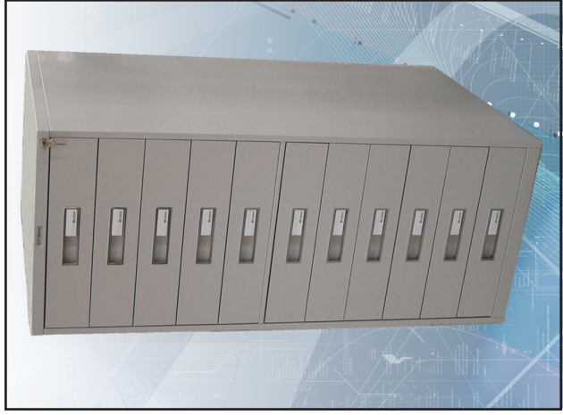
Eleven Drawers Drawer OD: 19 27/32" W, 4 5/16" H