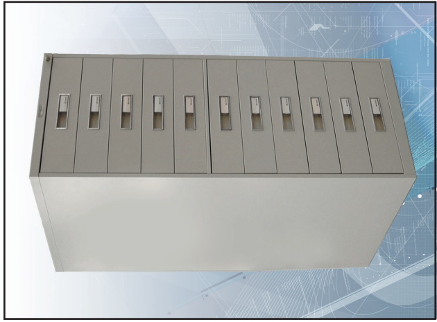
Microscope Glass Slide Cabinet 21 1/4" W, 51 5/8" H, 28 5/8" D