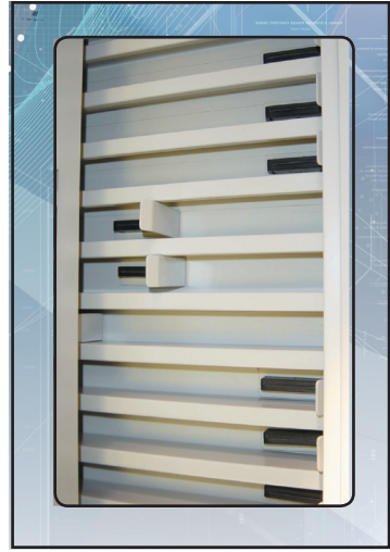
Eleven Magnetic Compressors per Drawer One per Row