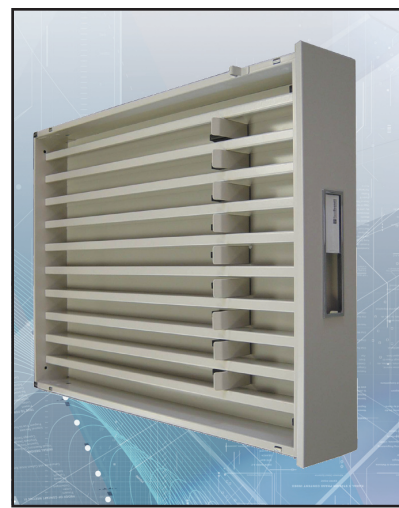
Eleven Rows per Drawer Row CID: 1 1/8" W, 4 1/8" H, 26 7/8" D